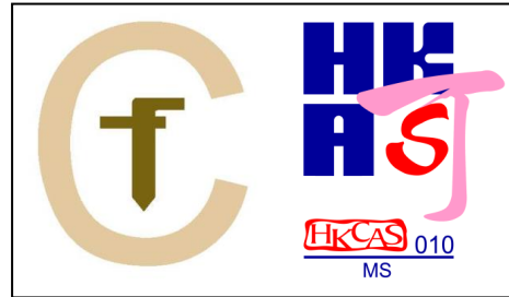
ISO 14001:2015 Registered Firm Certificate No. : EXXXX