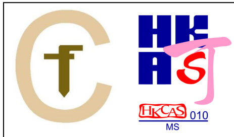
ISO 9001:2015 Registered Firm Certificate No. : QXXXX